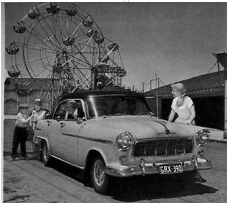
MODELS AVAILABLE: SPECIAL SEDAN (ABOVE), BUSINESS SEDAN, STANDARD SEDAN - PRICES FROM $215 PLUS TAX