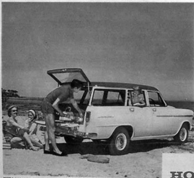
MODELS AVAILABLE: SPECIAL STATION SEDAN (ABOVE), STANDARD STATION SEDAN - PRICES FROM $215 PLUS TAX