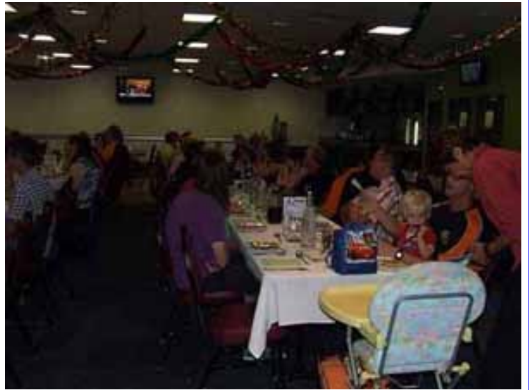
Christmas Function at Parahills Community Club