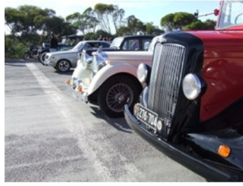
Gentlemen, start your engines...