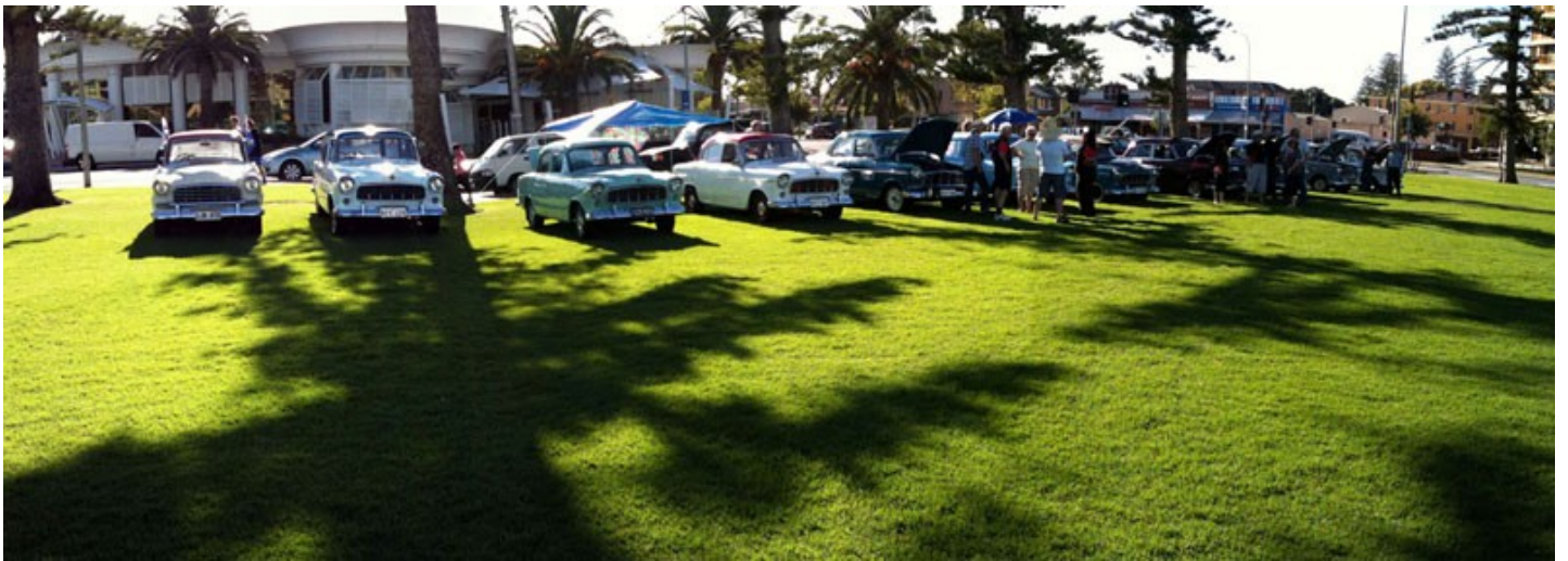
All Holden Day at Glenelg January this year