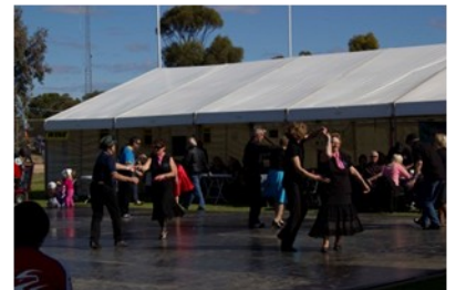
The crowds at the Wallaroo marshalling yards and rock'n'roll dancers entertain the crowds at Kadina