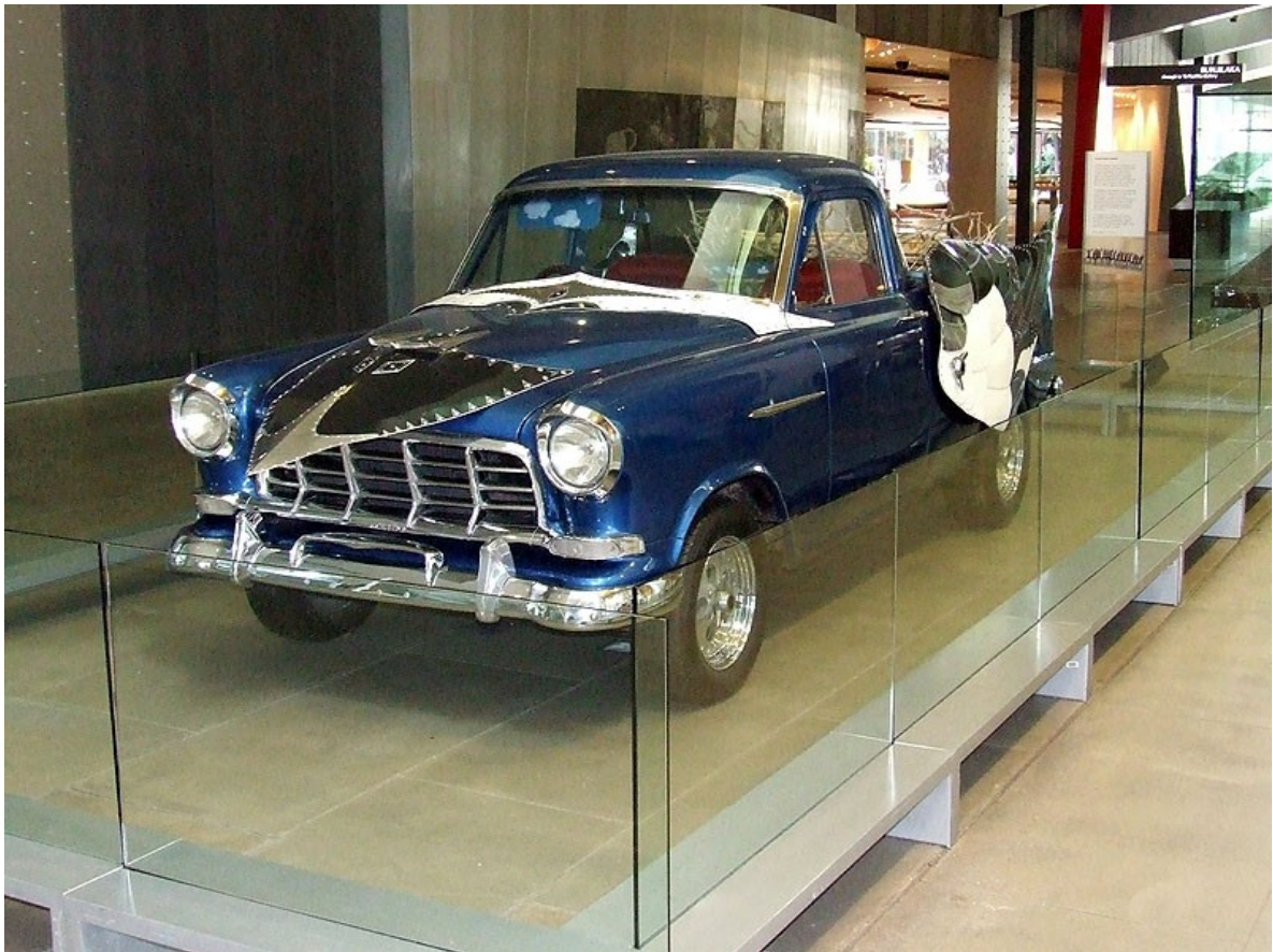
Photographed in the Melbourne Museum April 2011 Ute transformed into a Magpie