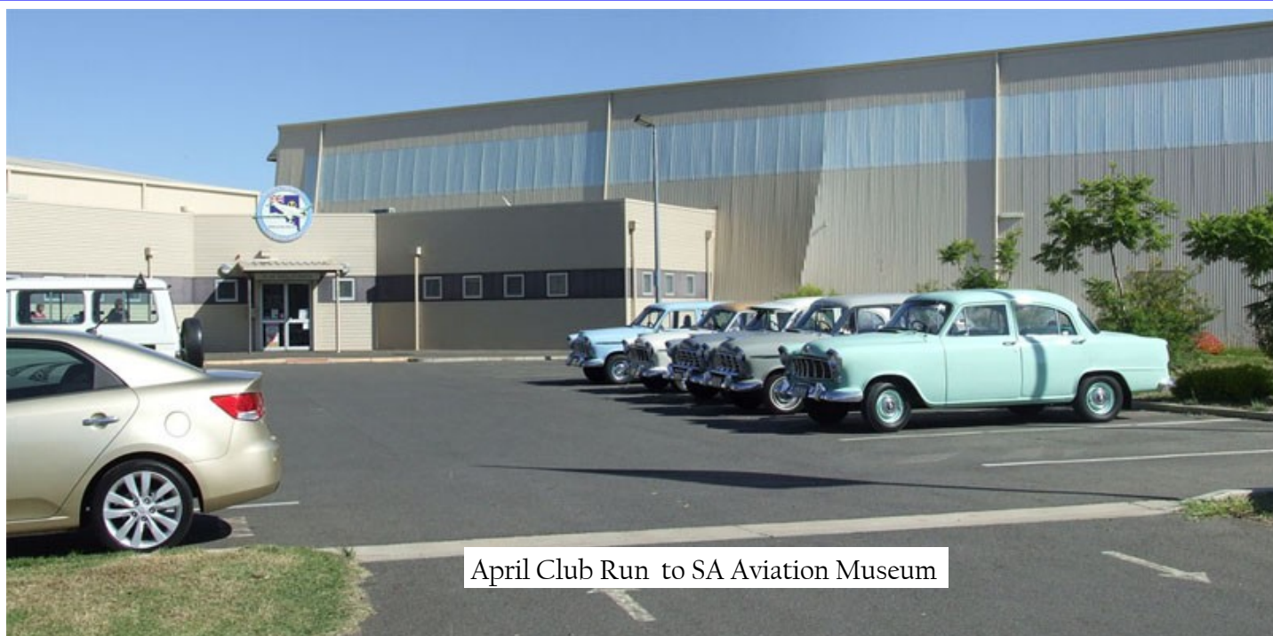
April Club Run to SA Aviation Museum