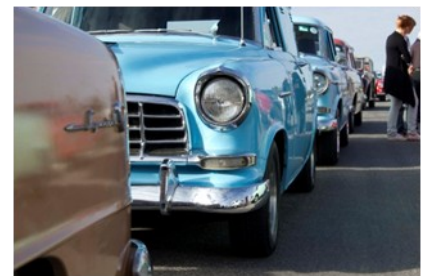
At the showground at Kadina