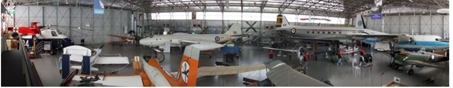
April Club Run to SA Aviation Museum