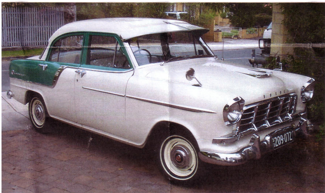
1959 fc Holden 0402296222