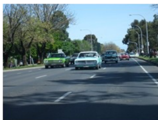
Off we go!