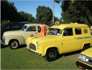
Joke: How many RAA vehicles does it take to change a starter motor?