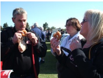
...and are pleasantly surprised to find he didn't eat them all on the way back...