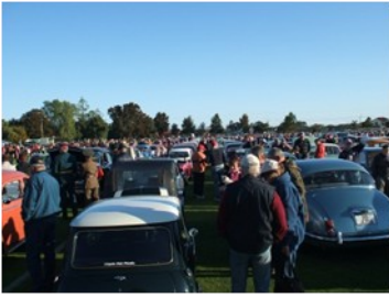
The early morning crowds at Barratt Reserve