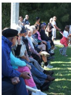
Crowds see-off the vehicles at the starting line