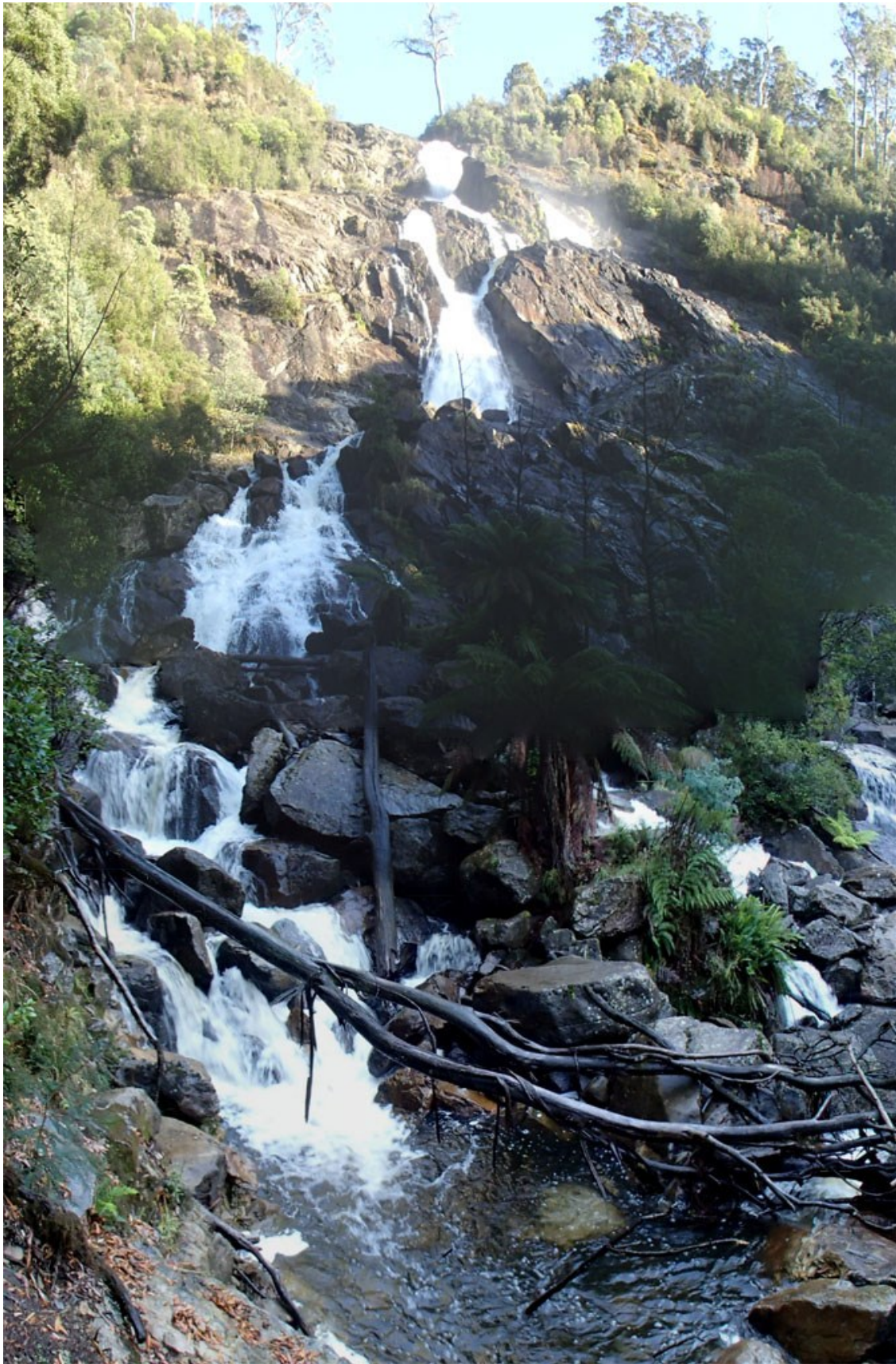
St Columba Falls near St Helens