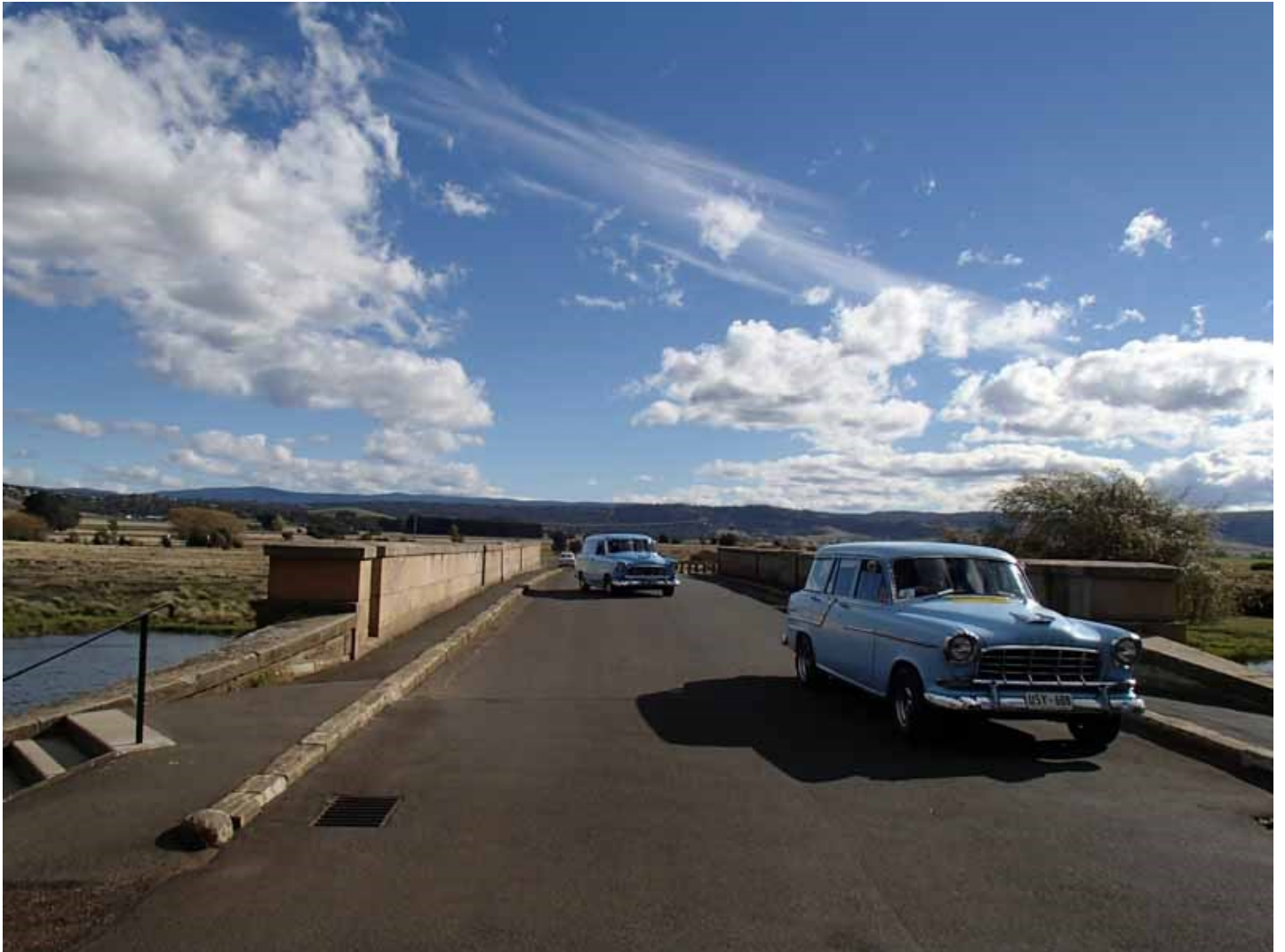
Ross Bridge in Ross