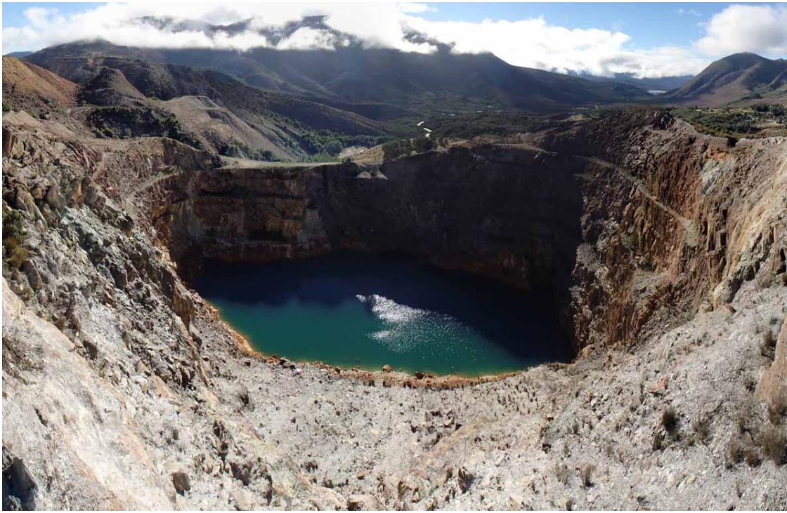
Old Iron Blow Mine