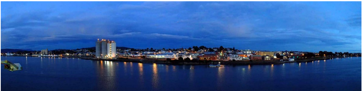
Devonport on the morning of arrival.