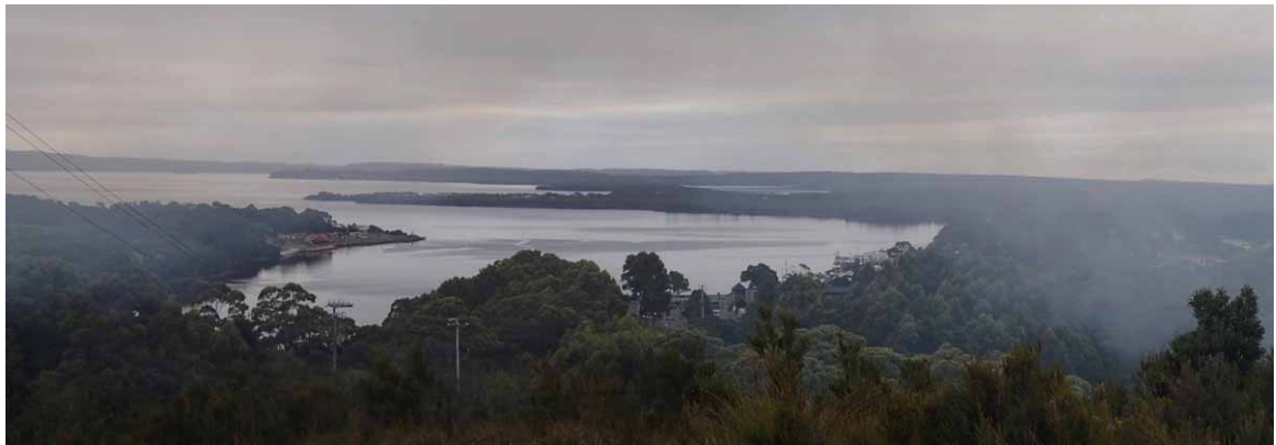
Water tower lookout in Strahan