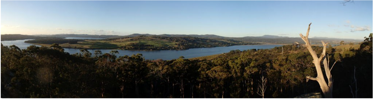
View from the lookout over the Tamar River